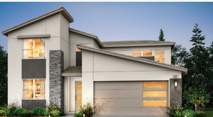
2023 St. Jude Dream Home – Res 220 • Contempo