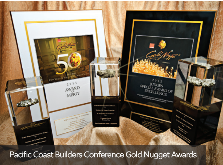
Pacific Coast Builders Conference Gold Nugget Awards

We hope this list of a few of our more recent recognitions will give you a glimpse into our commitment to you and our community.